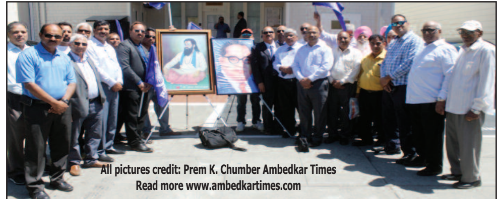
All pictures credit: Prem K. Chumber Ambedkar Times Read more www.ambedkartimes.com