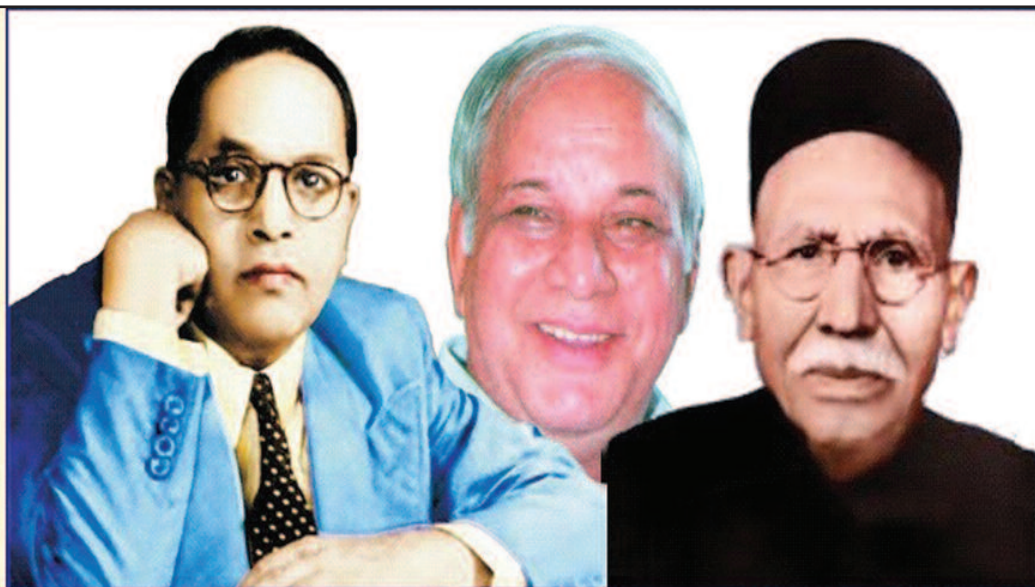
BABASAHEB DR. AMBEDKAR 14 April, 1891 - 6 December, 1956