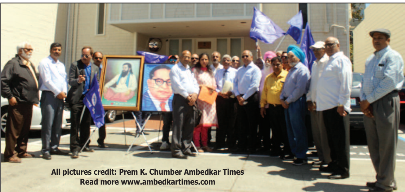
All pictures credit: Prem K. Chumber Ambedkar Times Read more www.ambedkartimes.com